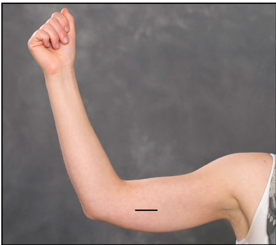
The implant is placed under the skin on the inside of your upper arm.

The procedure takes about 10 to 15 minutes.