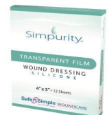
silicone film dressing