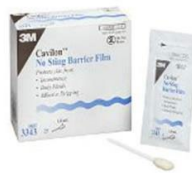
No-Sting Barrier Swabs