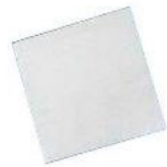
ST gauze sponge