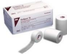
Medipore H Tape