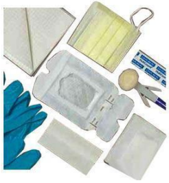
Kit DT19025 -daily OR Kit DT19030-weekly